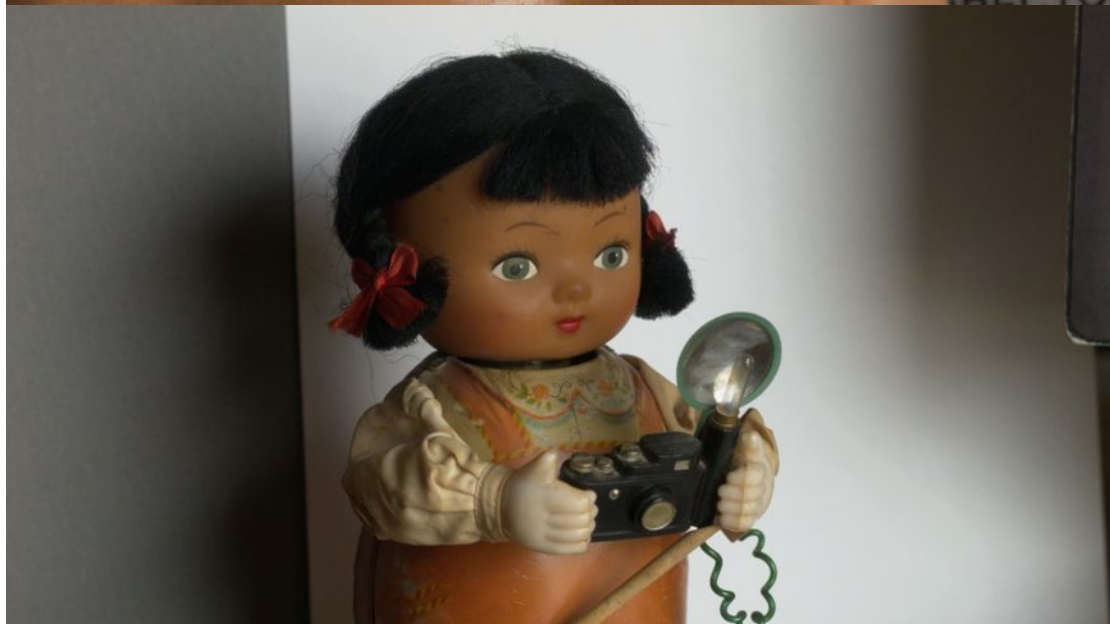
Soft effect # 2