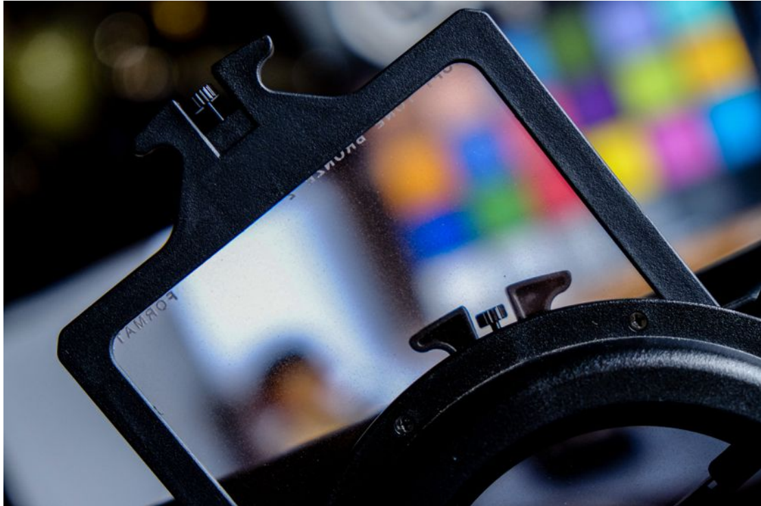
The surface of Formatt Soft-tone bronze # 2

The opposite effect, through an incredibly subtle diffusion-approach, that of almost providing a cooler tone, is offered by the "mysterious" Soft-tone Bronze: I admit that this is (so far) my personal preference, more so because the filtering effect is so delicate as far as diffusion goes, plus the "colorless" touch by the bronze particles, provides that cool toning-down of colors; here I should add that contrary to the possible absence of an in-between density as in the Supersoft-Gold series, the Soft-tone Bronze series could benefit from a heavier density as well, such as # 3 & 4.