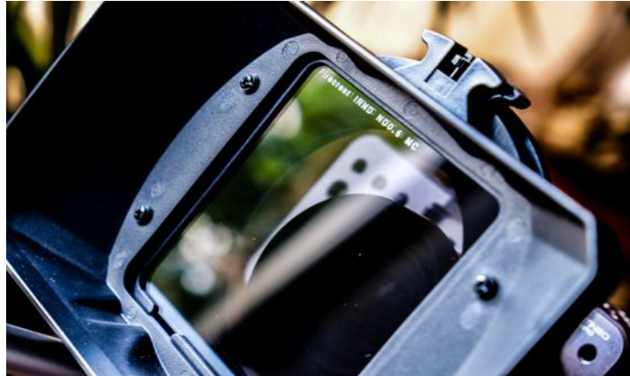
Firecrest IRND # 0.6 MC