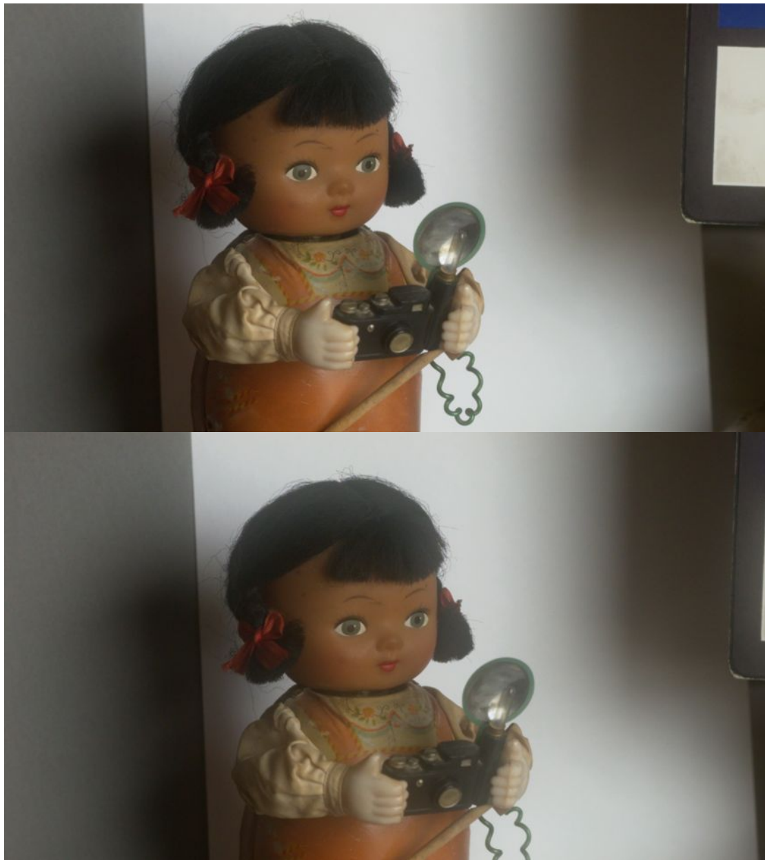
Supersoft Gold # 1 & 2

This long intro focuses though on the personal approach and on purely motion picture imaging; it is at least an individualistic interpretation in words (and some pictures as well), of what an image consists of, even more so combined with different flavor of glass as offered on lenses by Zeiss, Cooke, Angénieux, Leica, Canon, Fujinon, Kowa and my personal favorites the unique Optar-Illuminas. On my first approach in trying to interpret the pictorial qualities offered by the new-line of Formatt-Hitech filters, for both practical as well as for as neutral as possible and pure imagery reasons, I used a medium long-lens, the "portrait" focal-length offered by Sigma in their Art-series, the excellent 60mm: this a truly sharp little lens, a well known "secret" among m4/3 cognoscenti. I chose for similar reasons the little Blackmagic-Pocket camera (super-16mm sensor), whose absence of an optical low-pass filter provides very sharp image-files, ideal for such a test, while all shooting took place under natural/ambient side lighting as provided by early afternoon.