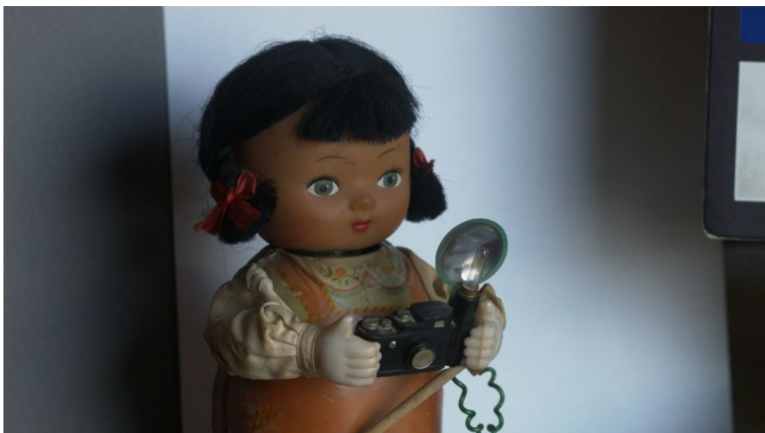
Soft-tone Bronze # 1

The opposite effect, through an incredibly subtle diffusion-approach, that of almost providing a cooler tone, is offered by the "mysterious" Soft-tone Bronze: I admit that this is (so far) my personal preference, more so because the filtering effect is so delicate as far as diffusion goes, plus the "colorless" touch by the bronze particles, provides that cool toning-down of colors; here I should add that contrary to the possible absence of an in-between density as in the Supersoft-Gold series, the Soft-tone Bronze series could benefit from a heavier density as well, such as # 3 & 4.