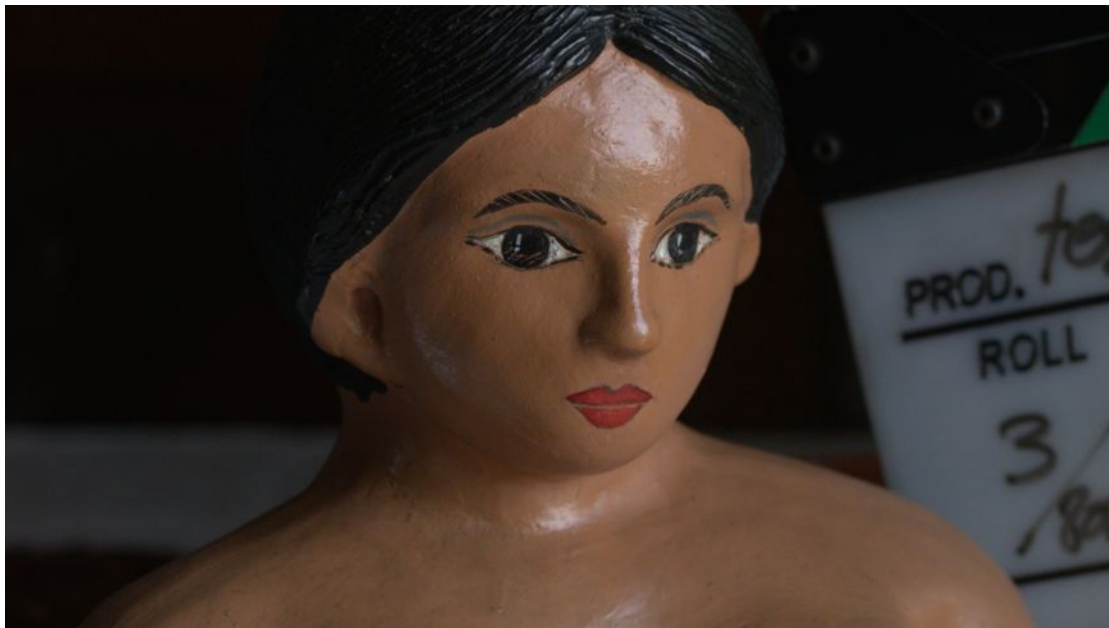
Soft-tone Bronze # 1

The Clear Supermist (densities # 1/8, 1/4 & 1/2) and the Soft-effect (#1 & 2), are variations of a more "traditional" approach to diffusion as offered by other companies as well. That does not mean that they are not valuable: on the contrary. The diffusion effect offered in both cases is both subtle and delicate, while the densities we tried are indeed fine as graduations, although a slight question mark could be posed on the level of an intermediate possibility between the # 1 & 2 densities, regarding the Soft-effect. We were really impressed by the finesse offered through the use of the Clear Supermist series: the sharpness is still there, while the patina offered does not provide a cruel halo around highlights, rather a softening fall-off between whites and blacks. The Soft-effect on the other hand, provides a less "drastic" approach and increases in our opinion the photogenic possibilities of the subject matter, while carefully hiding extreme reflections.