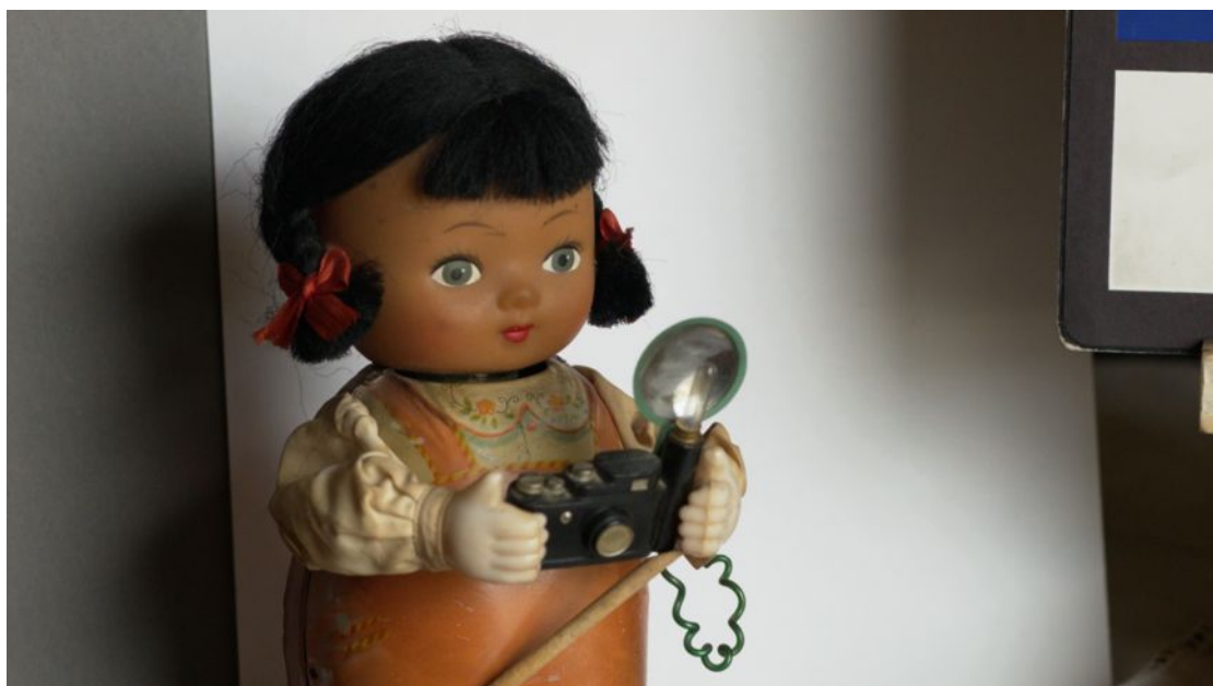
Firecrest IRND # 0.6 MC