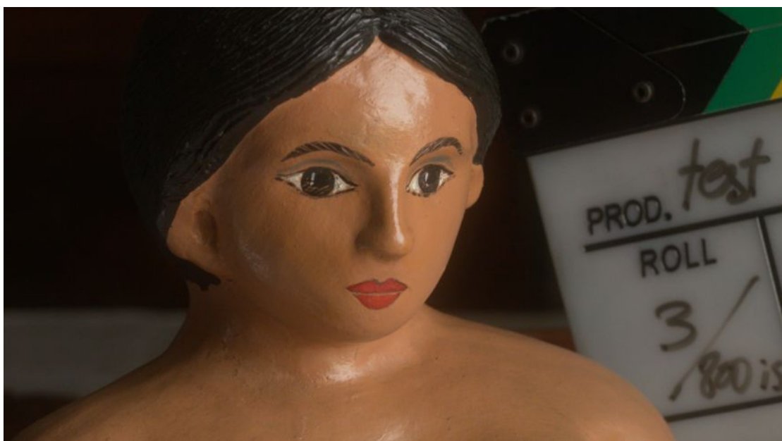
Supersoft Gold # 1

Since I do not belong to the “fix it in post” approach, in cinema terms at least, something that I indulge though to in the well-known environment of Lightroom when I “relax” (!?) manipulating the Raw-stills I take for my personal “therapeutical” reasons, in my main field, cinematography that is, I still remain a purist. I have used all the main brands offered traditionally in cinema matters and I admit that I always had a weakness for the first filters I purchased upon my mentor’s recommendation, the late Louis Horvath 2 , after graduating from the Cinematography program of the American Film Institute, a quarter of century ago, manufactured by one of the oldest companies in cinema, the legendary Harrison & Harrison . But things change and filters have evolved as well, plus the new digital sensors demand different approaches, just like film stocks did.