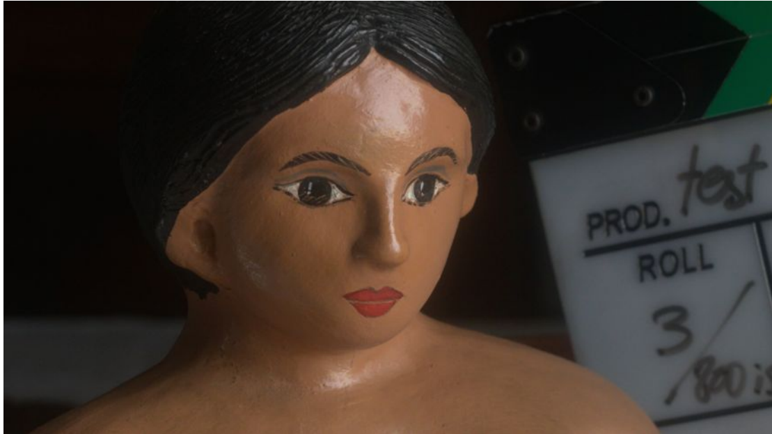
Clear Supermist # 1/4

Since I do not belong to the “fix it in post” approach, in cinema terms at least, something that I indulge though to in the well-known environment of Lightroom when I “relax” (!?) manipulating the Raw-stills I take for my personal “therapeutical” reasons, in my main field, cinematography that is, I still remain a purist. I have used all the main brands offered traditionally in cinema matters and I admit that I always had a weakness for the first filters I purchased upon my mentor’s recommendation, the late Louis Horvath 2 , after graduating from the Cinematography program of the American Film Institute, a quarter of century ago, manufactured by one of the oldest companies in cinema, the legendary Harrison & Harrison . But things change and filters have evolved as well, plus the new digital sensors demand different approaches, just like film stocks did.