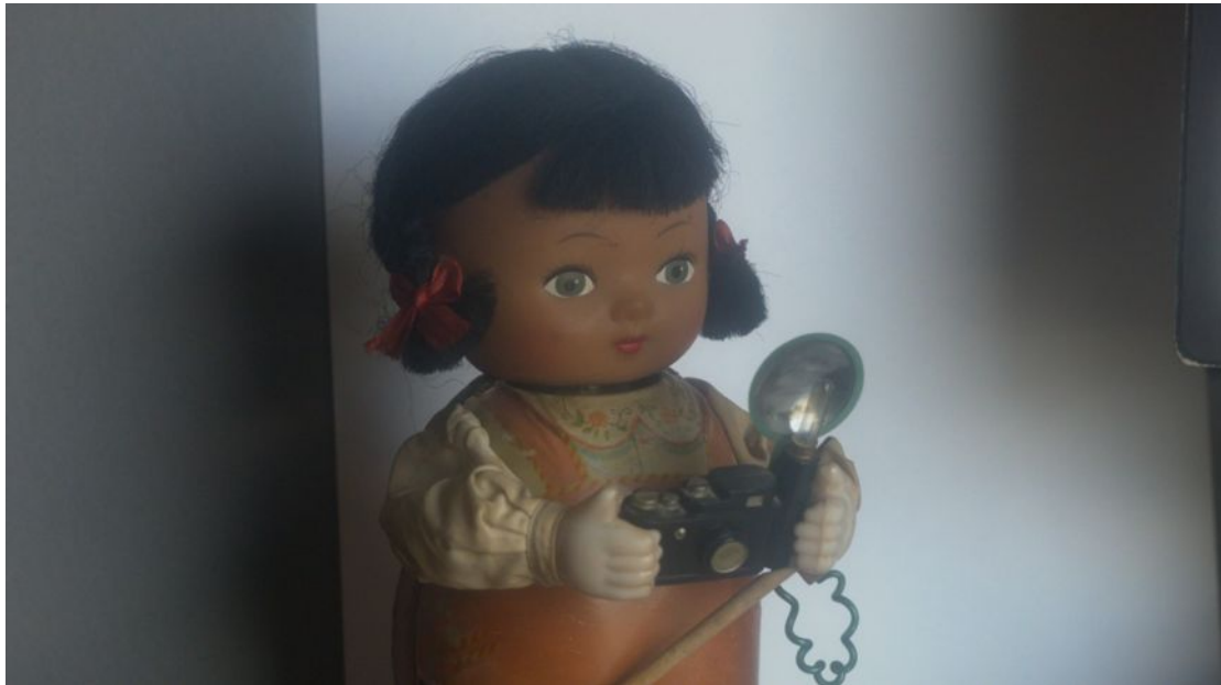
Clear Supermist # 1/2

The diffusion series tested, consisted of nine filters including: Clear Supermist # 1/8, 1/4 & 1/2, Soft-effect #1 & 2, Soft-tone Bronze #1 & 2, Supersoft-Gold #1 & 2.