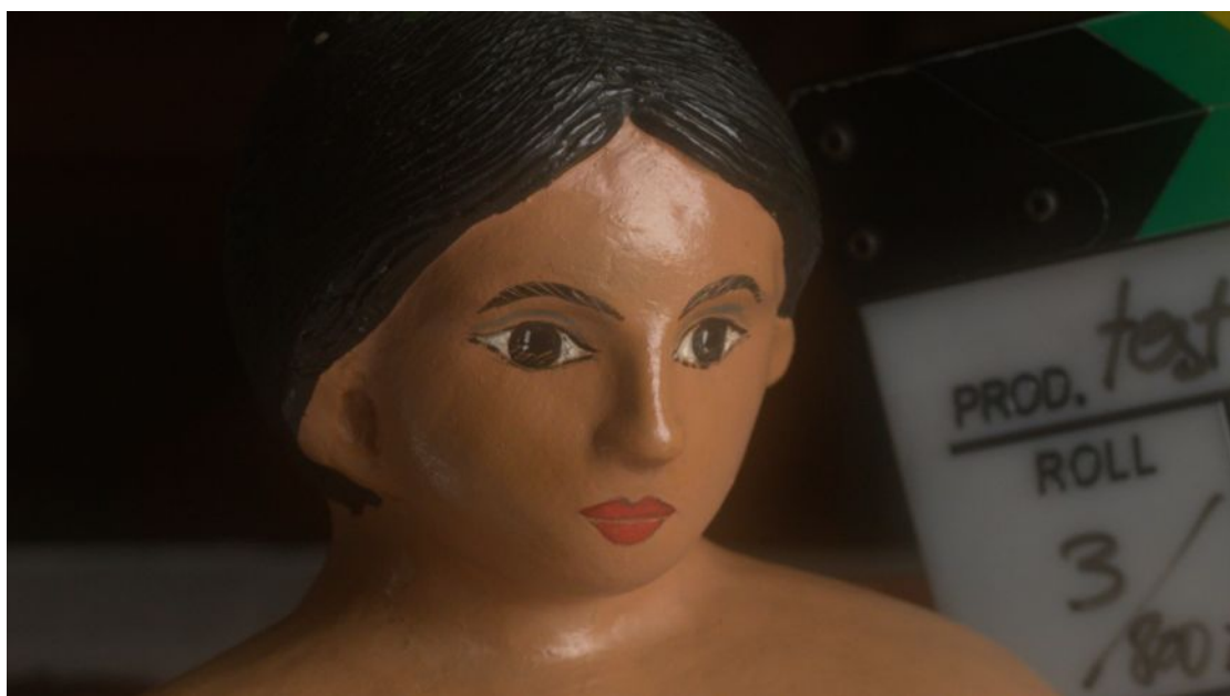
Supersoft Gold # 2