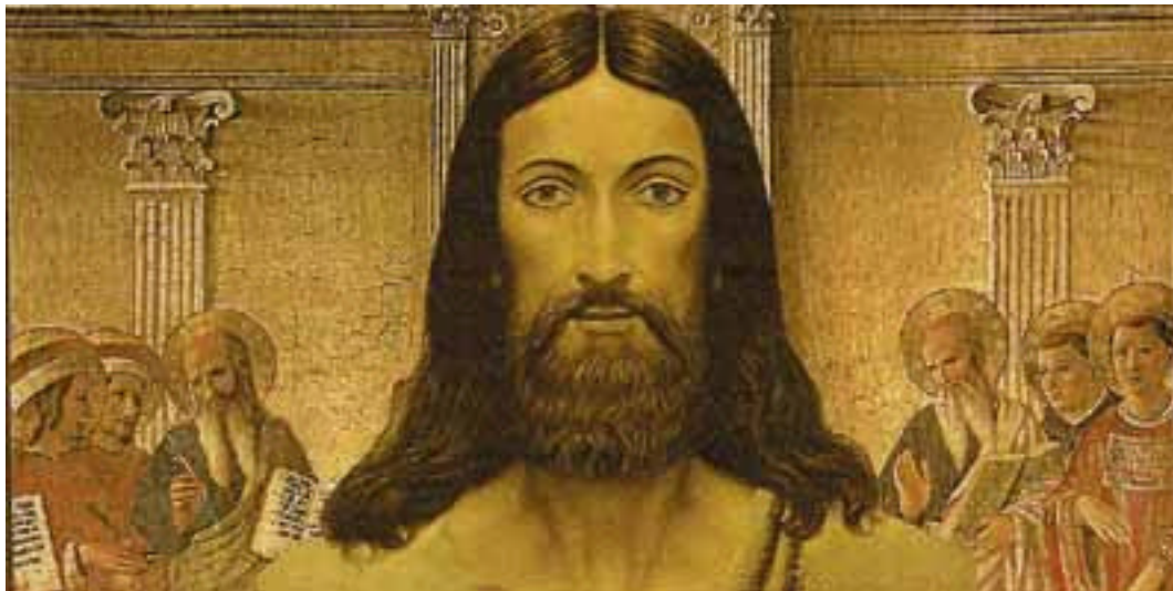
Film "MESSIAH" to be filmed in Epic UNIVISION 65mm Gate 24x48mm Aspect ratio 1:2.